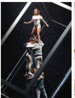
CIRQUE FLIP FABRIQUE 4/13