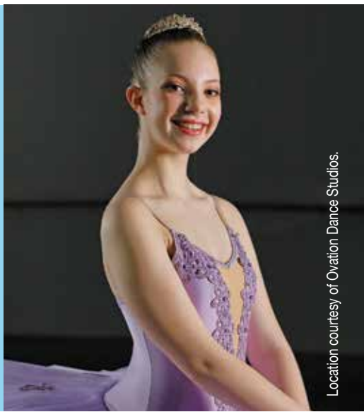
Location courtesy of Ovation Dance Studios.

We've served this richly diverse region as a community hospital for more than 60 years. And as the area has grown, so have we. But as Long Island doctors, nurses, and healthcare professionals, we've never outgrown our devotion to the health of the community we all call home.