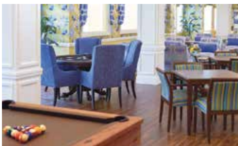
Photos: Bistro, The Bristal at Holtsville; Dining Room & Game Room, The Bristal at Sayville