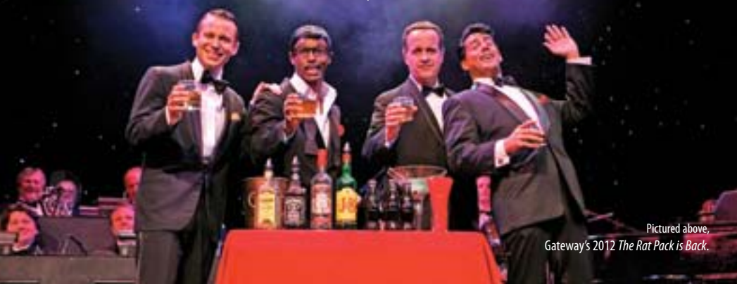
Pictured above, Gateway's 2012 The Rat Pack is Back .