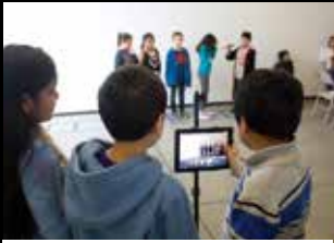
Animation & Filmmaking Classes