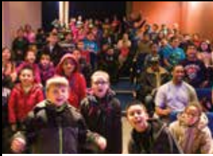
Media Literacy & Field Trips