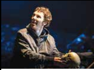
Filmed Plays & Operas