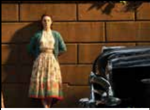
Critically Acclaimed Films