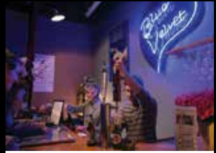
Blue Velvet Lounge Wine Bar