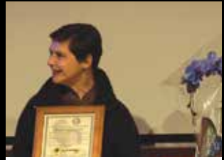
Guest Speakers & Seminars