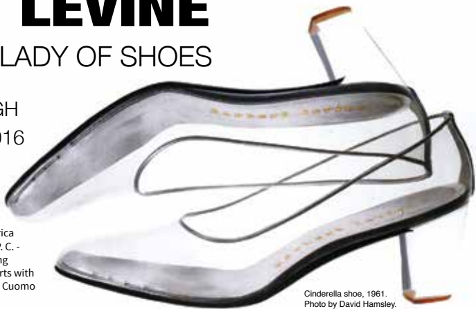
Cinderella shoe, 1961.